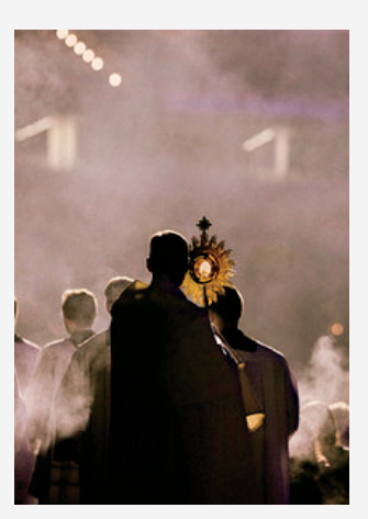
No, that's Jesus!