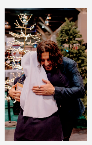
Is that Jesus?