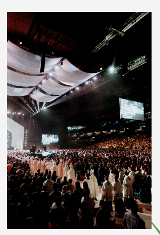
So many priests and bishops processing in for Mass!