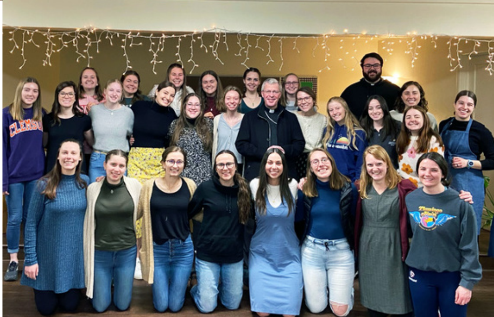
The women on retreat at Montana State University