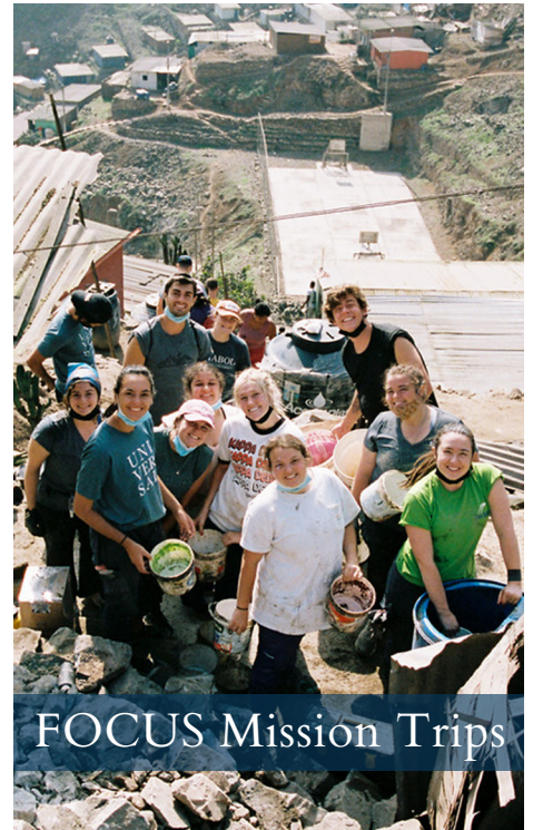
FOCUS Mission Trips