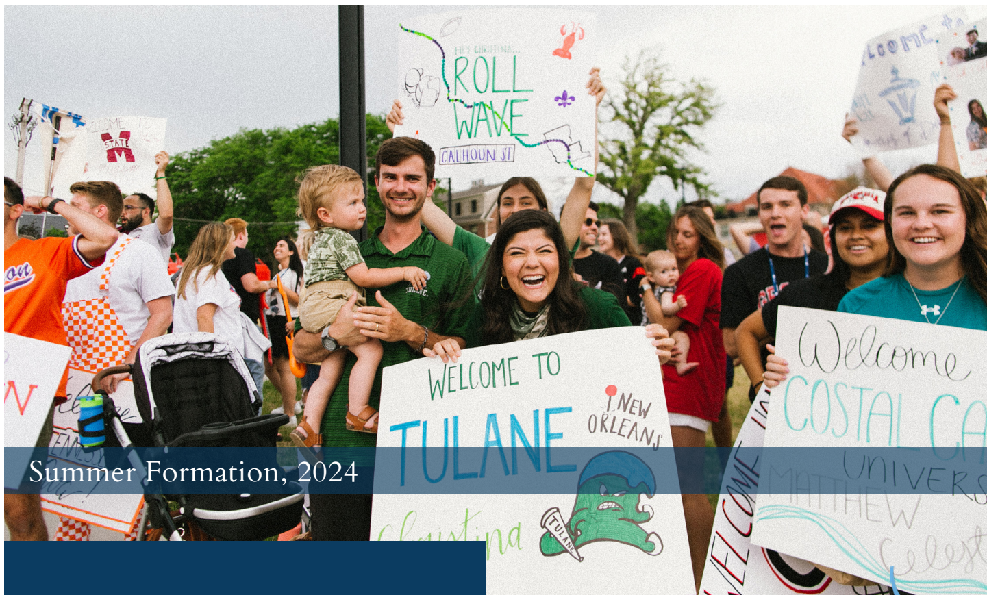
Summer Formation, 2024